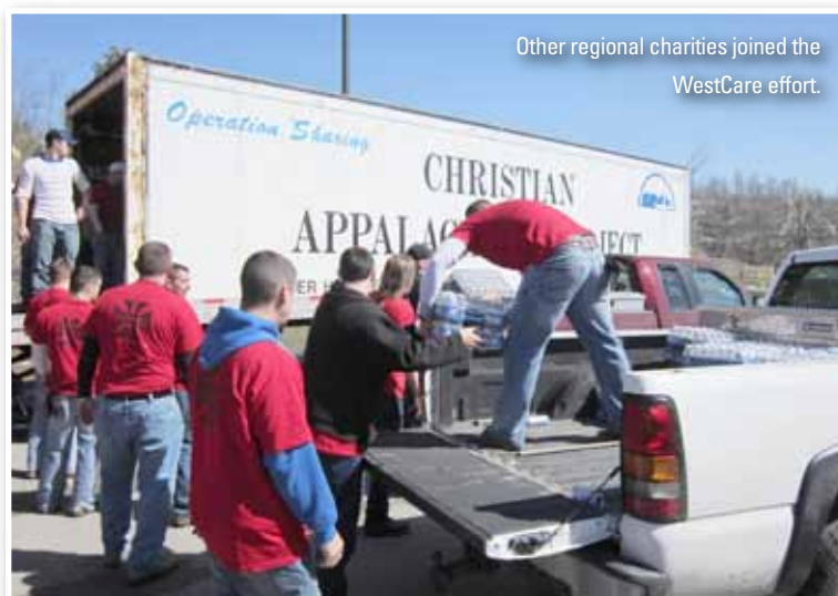
Other regional charities joined the WestCare effort.