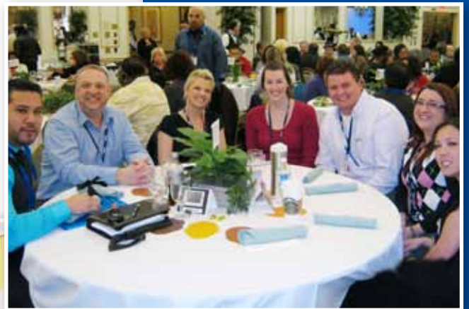
▲ Some of the hundreds of attendees at SASCA conference