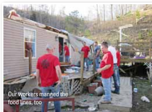
Our workers manned the food lines, too

The residents left early Tuesday morning and returned to the facility late that night. Then, they repeated the round-trip the next day. The residents worked diligently both days without stopping, except for a one hour lunch which was provided by area churches. On Tuesday, WestCare residents loaded a tractor trailer full of bottled water from the Health Department, and then unloaded and distributed them at City Hall, where a refuge had been created for local victims, providing food, drinks, clothing and access