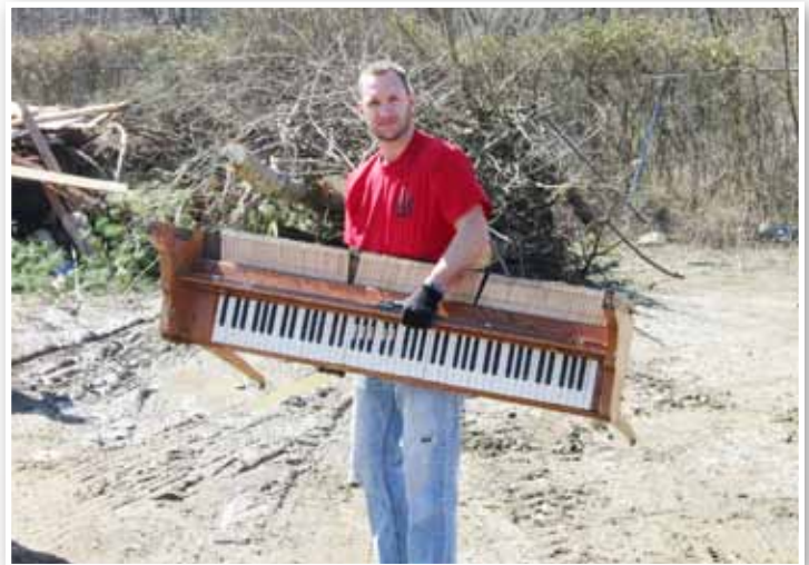
Crew stores property in secure building.