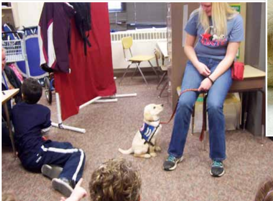
▼ Allegiance and Victory, patriotic partner puppies!