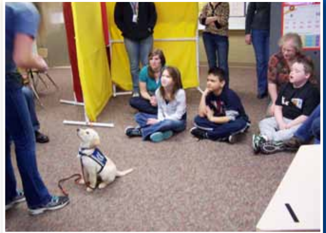
▲ Elementary kids are mesmerized by Honor