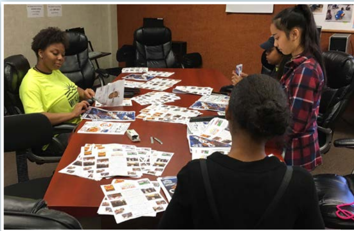
Earn and Learn youth preparing for community outreach in Milwaukee's Harambee neighborhood.

Through a partnership with the Employ Milwaukee and the City of Milwaukee, WestCare Wisconsin facilitates Earn and Learn , a summer youth employment program. Combined with our Youth Action Council , WestCare Wisconsin is keeping our youth very busy this summer.