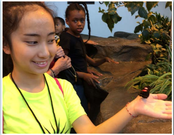
Earn and Learn youth enjoy a field trip to the Milwaukee Public Museum to learn about culture and community.