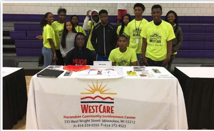
Earn and Learn youth passing out free gun locks at the Fatherhood Summit in Milwaukee's Granville neighborhood.