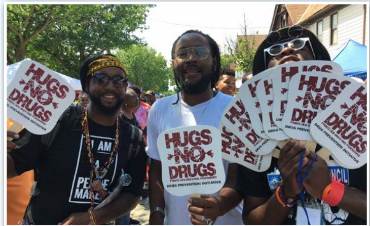
Youth Action Council and Earn and Learn youth participate in Garfield Days Festival and pass out information as part of their Hugs No Drugs drug prevention program.