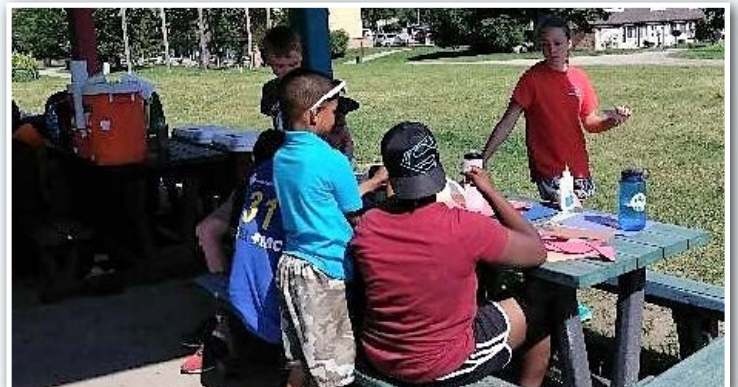
Introduction Peace Party for our new neighbors and friends in the Bradley Courts Town Homes in the Granville Neighborhood.

As part of its goal to uplift the human spirit, WestCare Wisconsin hosts community outreach events called Sidewalk Talks and Peace Parties to bring youth and their families out of their homes to get active, play games, and enjoy free food and music.