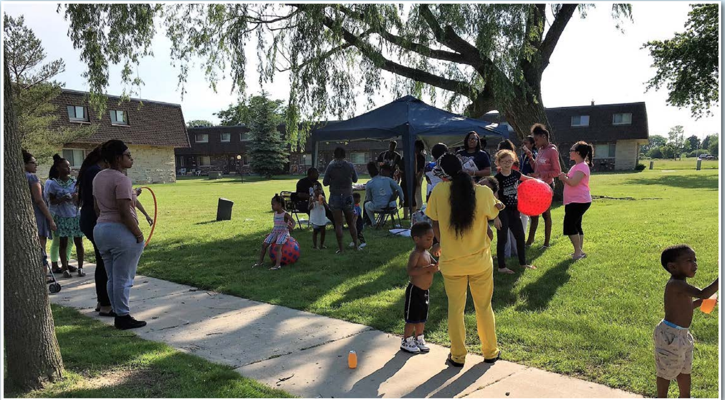
Sidewalk Talk event for neighbors and friends in the Woodland Condos Pavilion in the Granville Neighborhood.

As part of its goal to uplift the human spirit, WestCare Wisconsin hosts community outreach events called Sidewalk Talks and Peace Parties to bring youth and their families out of their homes to get active, play games, and enjoy free food and music.