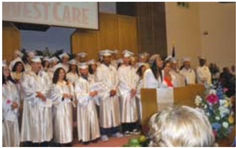
▲ Above: Our recent graduation on 11-13-08. It was the largest one to date.