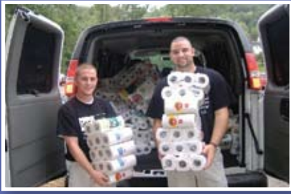
Above: WestCare Kentucky residents unload several thousand rolls of toilet paper they received as a donation from Operation Unite Coalitions in Rockcastle and Bell Counties.