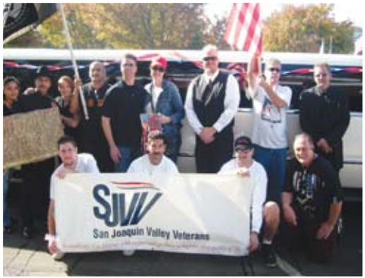
Above: WestCare Veterans celebrate Veteran's Day. ▲

Network (ISFAC) through the National Guard. Recently, SJVV was awarded a pilot grant from the VA that will allow for 20 female veterans to stay in transitional housing for two years, receive reintegration services, and keep their children with them through the process. This is a first for the VA and SJVV is excited to be a part of it.