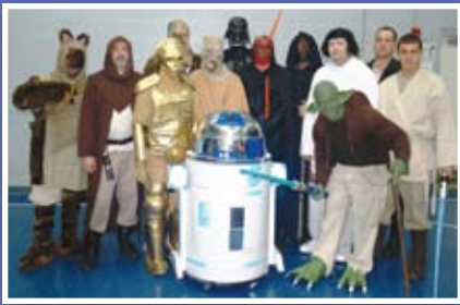
For the third year in a row, WestCare Kentucky celebrates Halloween by hosting trick or treat for the children who live in the area. This year the residents and staff at the facility dressed as Star Wars characters.