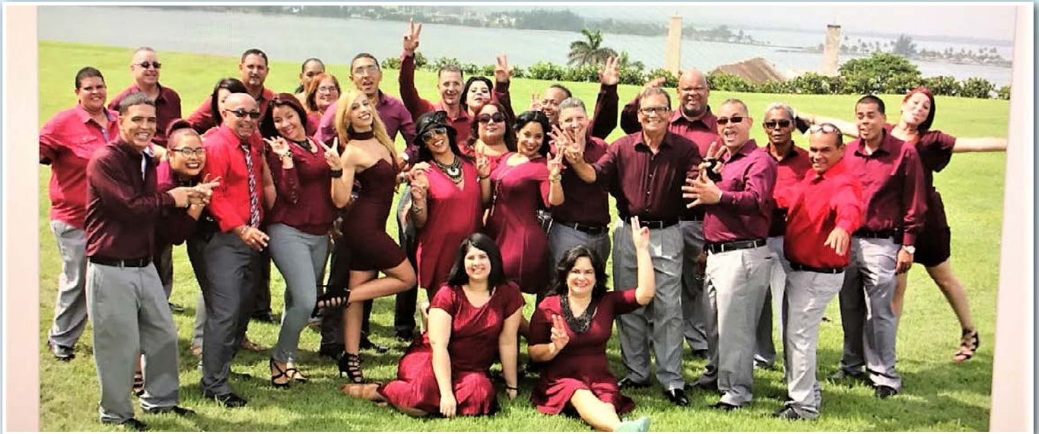
The merry WestCare Puerto Rico rascals pose for their annual Christmas card, sent to sponsors and grantors. Nice!!