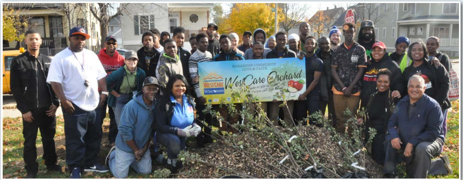
WestCare Wisconsin marshaled numerous agencies and volunteers to begin an apple orchard in the neighborhood. The tree planting project is a collaborative and learning experience for urban agriculture and future jobs in the industry.