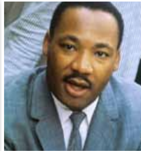
Reverand Martin Luther King Jr.