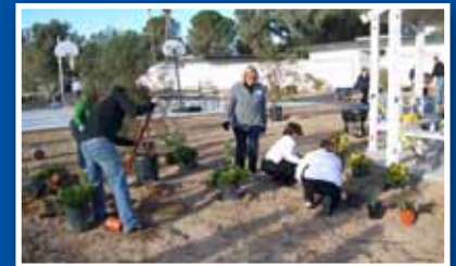
Volunteers help landscape the area within the new walking track