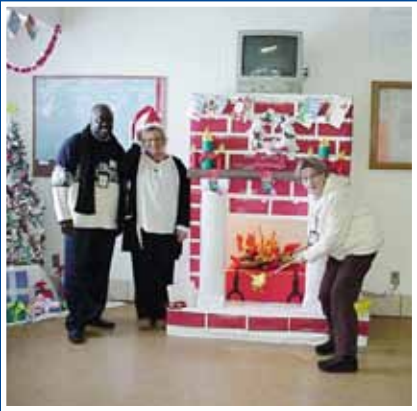
Holiday decorating contest winners at Sheridan: Clients in Housing Unit C17.