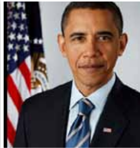
U.S. President Barack Obama

This was changed to a full month celebration in the year 1976 when the U S president officially declared February to be the black History month. The two men who changed the lives of black Americans, Abraham Lincoln the former President and the creator of emancipation proclamation born on February 12th, and Frederic Douglass, a former slave, abolitionist and a politician born on February 14th are honored by celebrating the upliftment of African Americans during their birth month Woodson also dedicated his time to develop books, magazines and newspapers to publicize the African American achievements.