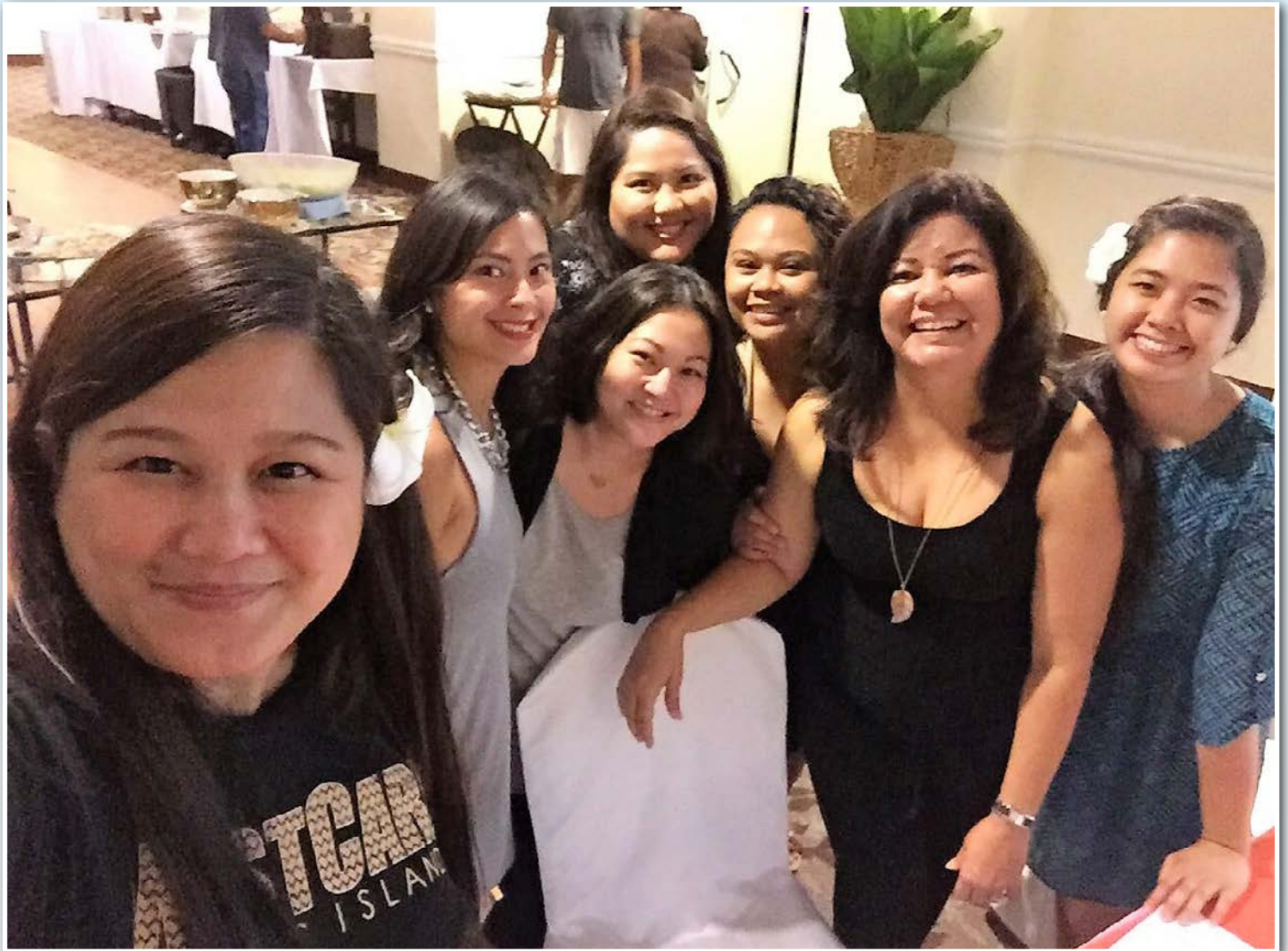
And in paradise, lovely faces helped bring in the holiday season for WestCare Pacific Islands.