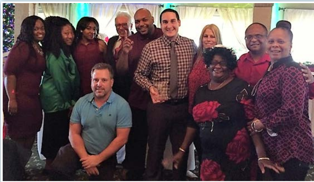
FITT (Families in Transition Team) - Program of the Year