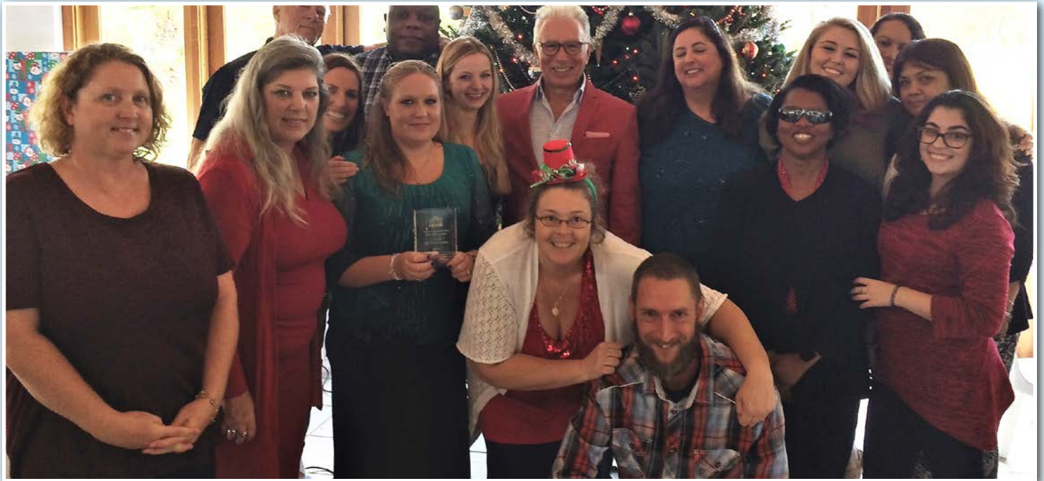
InPatient Unit - Program of the Year