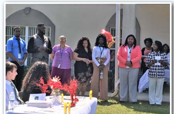
Youth Academy Staff