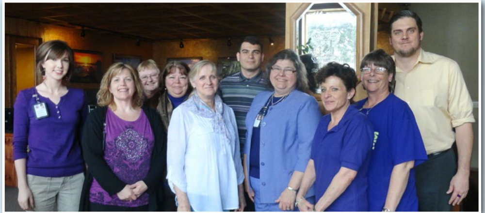
FAVA Staff in Iowa proudly supports Military Children

http://www.militarychild.org/news-and-events/april-is-month-of-the-military-child