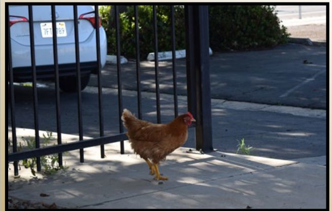
Sally the Hen Fresno, CA

Staff at WestCare California's administration building in urban Fresno got a surprise visitor, a hen they named Sally , and delegated her for the job of Gate Security for the day. Thank you Sally for your service. (Hey, we're easily impressed)