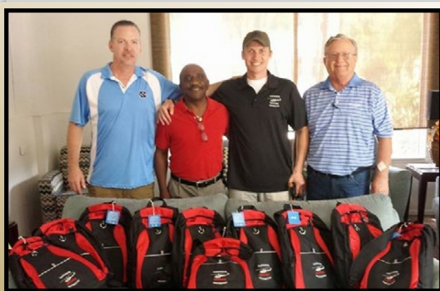
Claybaker DUSTOFF Foundation St. Petersburg, FL

The Claybaker DUSTOFF Foundation has donated ten CDF Survival Packs to WestCare's Mustard Seed Inn in St. Petersburg to help homeless veterans as well as transitioning vets. Support the Troops ( http://ourtroopsonline.com ) has graciously partnered with CDF to donate much of the contents. The CDF backpack and any items purchased in addition to those donated by Support the Troops are currently averaging a cost of $20.00 per backpack.