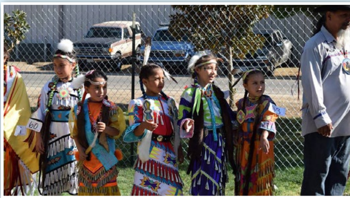
Young participants in the First Nations Pow Wow