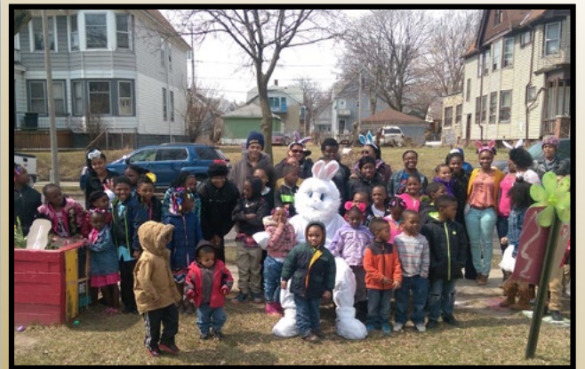
WestCare Wisconsin Staff Milwaukee, WI

WestCare Wisconsin's outreach efforts continue to help improve the once downtrodden Harambee North neighborhood in Milwaukee. Excellent work by our staff to facilitate a community Easter egg hunt that had been threatened with cancellation.