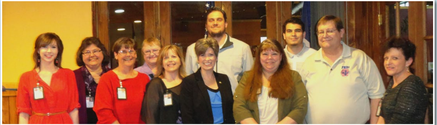
FAVA Staff with Senator Ernst