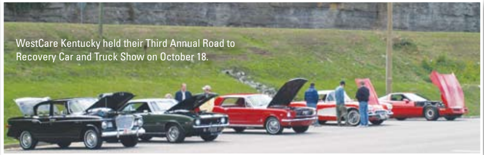
WestCare Kentucky held their Third Annual Road to Recovery Car and Truck Show on October 18.